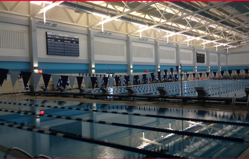
BEFORE: LED Westside Aquatic Center Project