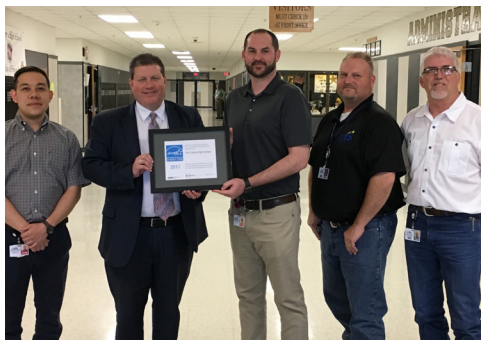
Energy Star Certification The Colony High School

To earn ENERGY STAR Certification, the U.S. EPA's recognition of superior energy efficiency, buildings must perform in the top 25 percentile of similar buildings nationwide. At LISD we have certified 62 of 64 eligible schools resulting in a 98% certification rate. LISD's overall Energy Star rating of 92 puts the districts in the top 8% of all districts nationwide. ENERGY STAR Certification provides third-party validation of energy efficiency improvements and helps build school pride. LISD's partnerships with Aramark Engineering and Asset Solutions (EAS), has helped direct more money into the classroom while reducing environmental impacts.