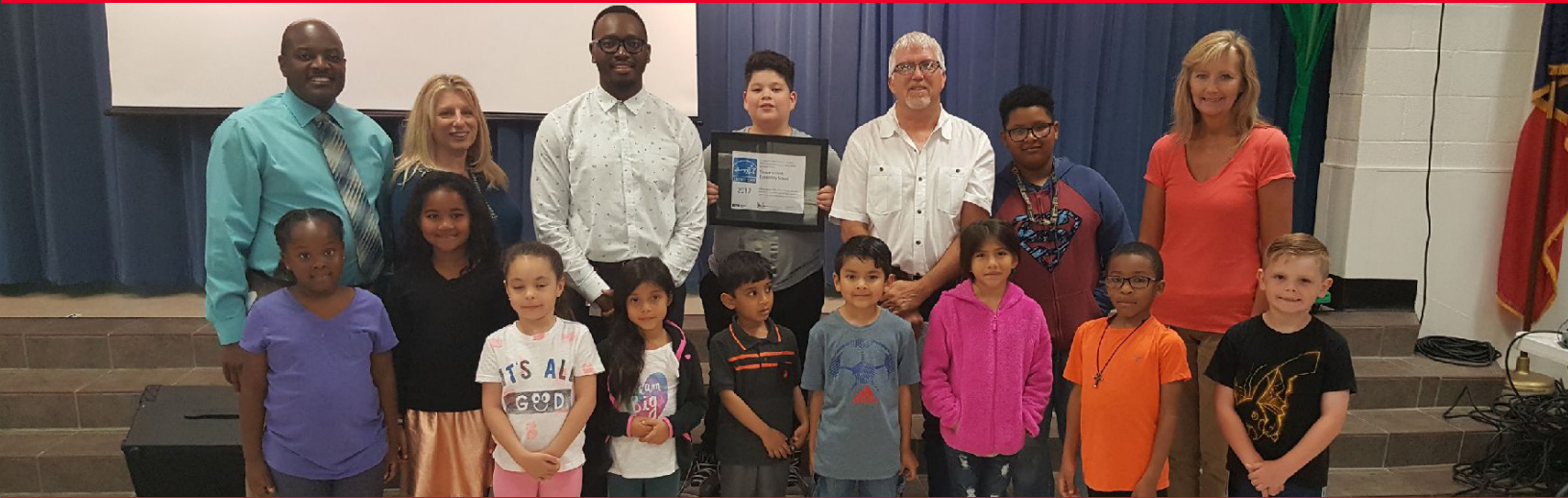
Energy Star Certification - Stewart's Creek Elementary School