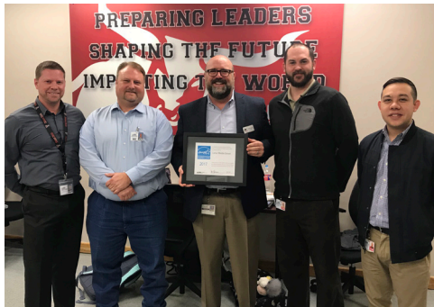
Energy Star Certification Lamar Middle School